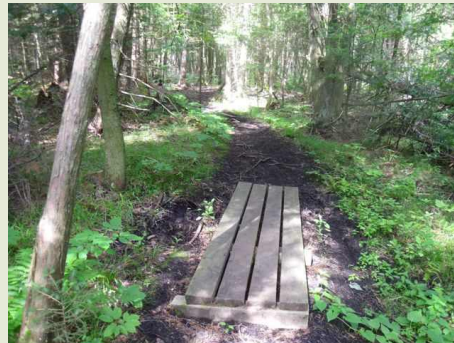
Each year, thanks to a Ministry of Natural Resource's program called MNR Rangers, we have been adding new boardwalk where the trail goes through wet areas.

of the Alton Legion Parking Lot. This kind of project is critical for managing the negative impacts of storm water run-off caused by urban development.